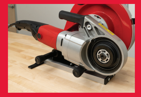
Pipe threader serves as the power source for bending.