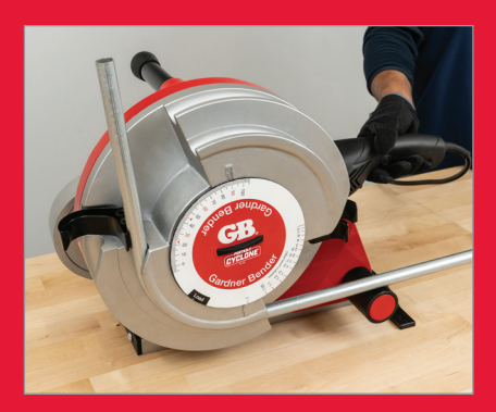
Make accurate bends with easy to read angle decal.